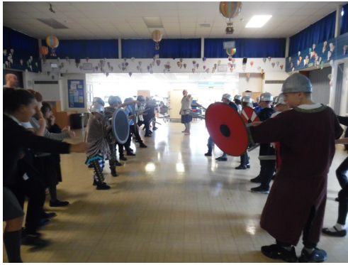
A battle begins against the Saxons.