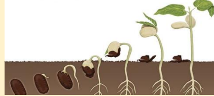
How a plant grows from a seed

Your child will be learning about plants in Science and Isambard Kingdom Brunel in History.